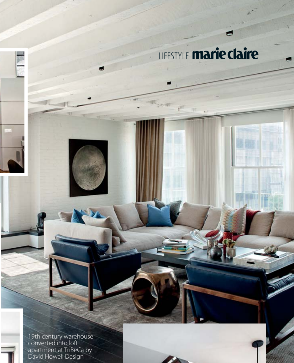
19th century warehouse converted into loft apartment at TriBeCa by David Howell Design