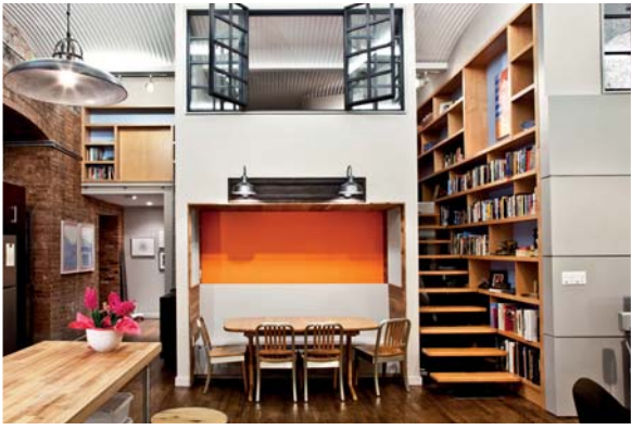
Former printing press turned loft by Design42 Architecture