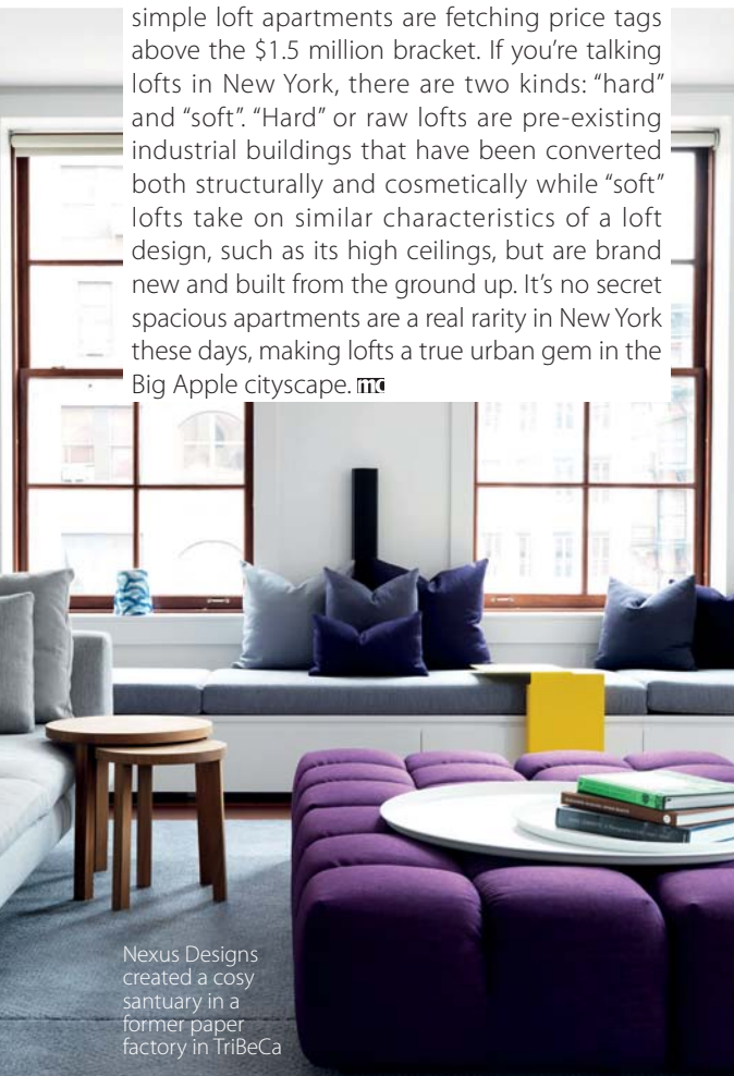
Nexus Designs created a cosy sanctuary in a former paper factory in TriBeCa

There is an uplifting quality about New York's loft style apartments – modern furnishings against the raw brick walls, large floor-to-ceiling windows that allow the generous flow of natural light—all of which work together to conjure an aesthetic that pays homage to the New York of old and new. Particularly in TriBeCa and SoHo, once desolate areas of New York City, loft-style living is booming. Over the past forty years, property values have sky rocketed, and simple loft apartments are fetching price tags above the $1.5 million bracket. If you're talking lofts in New York, there are two kinds: "hard" and "soft". "Hard" or raw lofts are pre-existing industrial buildings that have been converted both structurally and cosmetically while "soft" lofts take on similar characteristics of a loft design, such as its high ceilings, but are brand new and built from the ground up. It's no secret spacious apartments are a real rarity in New York these days, making lofts a true urban gem in the Big Apple cityscape. rta