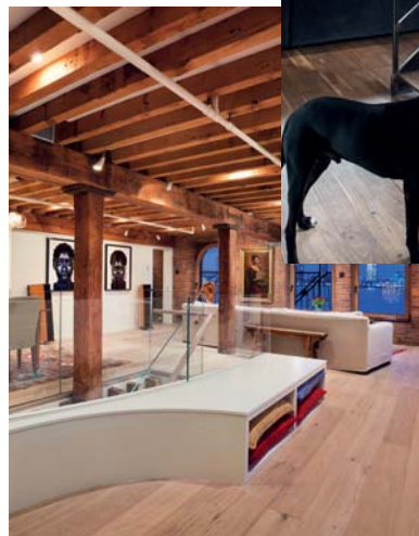
Mabbott Seidel Architecture connected the upper and lower floors of a TriBeCa loft duplex, while retaining light and view along the Hudson River